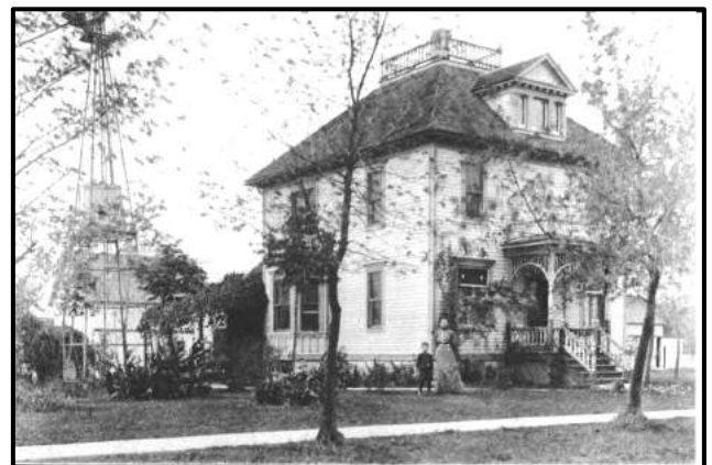
132 S. Prospect

The Becker house, 132 S. Prospect St., also had running water. Otto built a windmill that had a holding tank on top which held water from an underground spring. A pipeline carried the water from the windmill to the house. An indoor bathroom was a major feature in the house as was the first septic system in town.